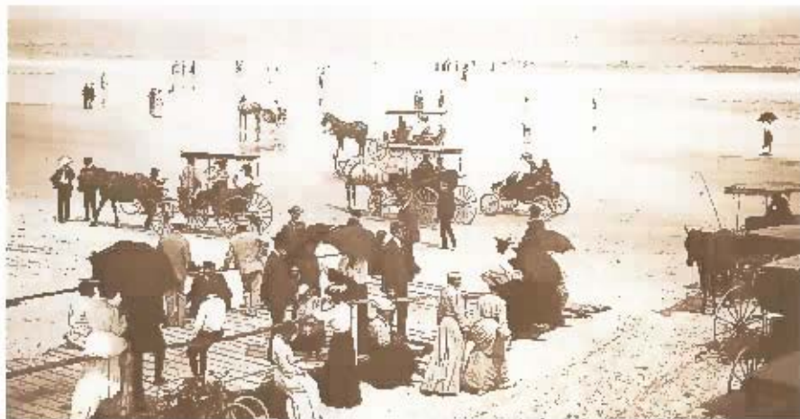
The beach at Seabreeze (Daytona Beach), 1904

By the turn of the century, Florida's population and per capita wealth were